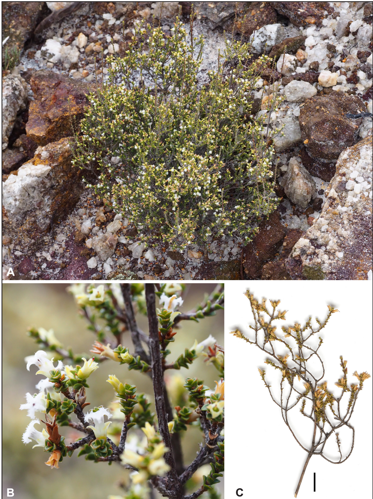
Figure 1. Styphelia halophila . A – flowering plant in situ ; B – flowering branchlet in situ ; C – scanned image of flowering branchlet. Scale bar C = 1 cm. Vouchers K. Walkerden 016-p (A, B), M. Golding 3 (C).

Etymology. From the Greek halo- (salt-) and philus (loving), a reference to the preferred habitat of the species.