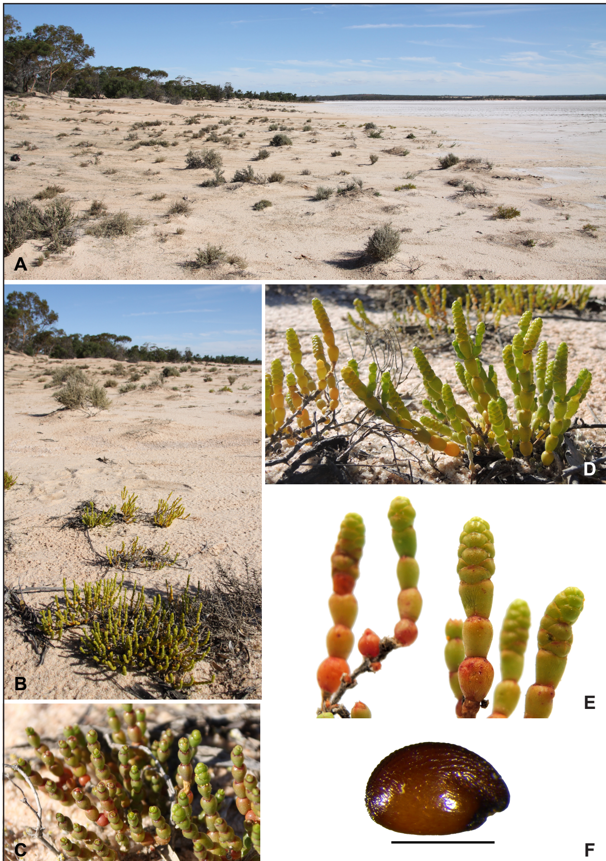
Figure 2. Tecticornia crotalus . A – habitat at the type locality; B – habit; C – glossy green vegetative articles with a red tinge; D – plants showing terminal, spike-like inflorescences; E – branchlet showing the obovoid to spherical vegetative articles and inflorescence with distinctive overlapping free bracts, reminiscent of a rattlesnake's tail; F – seed, scale bar = 1 mm. Vouchers: K.A. Shepherd & A. Žerdoner Čalasan KS 1950 (A–E); K.A. Shepherd & S.R. Willis KS 885 (F).