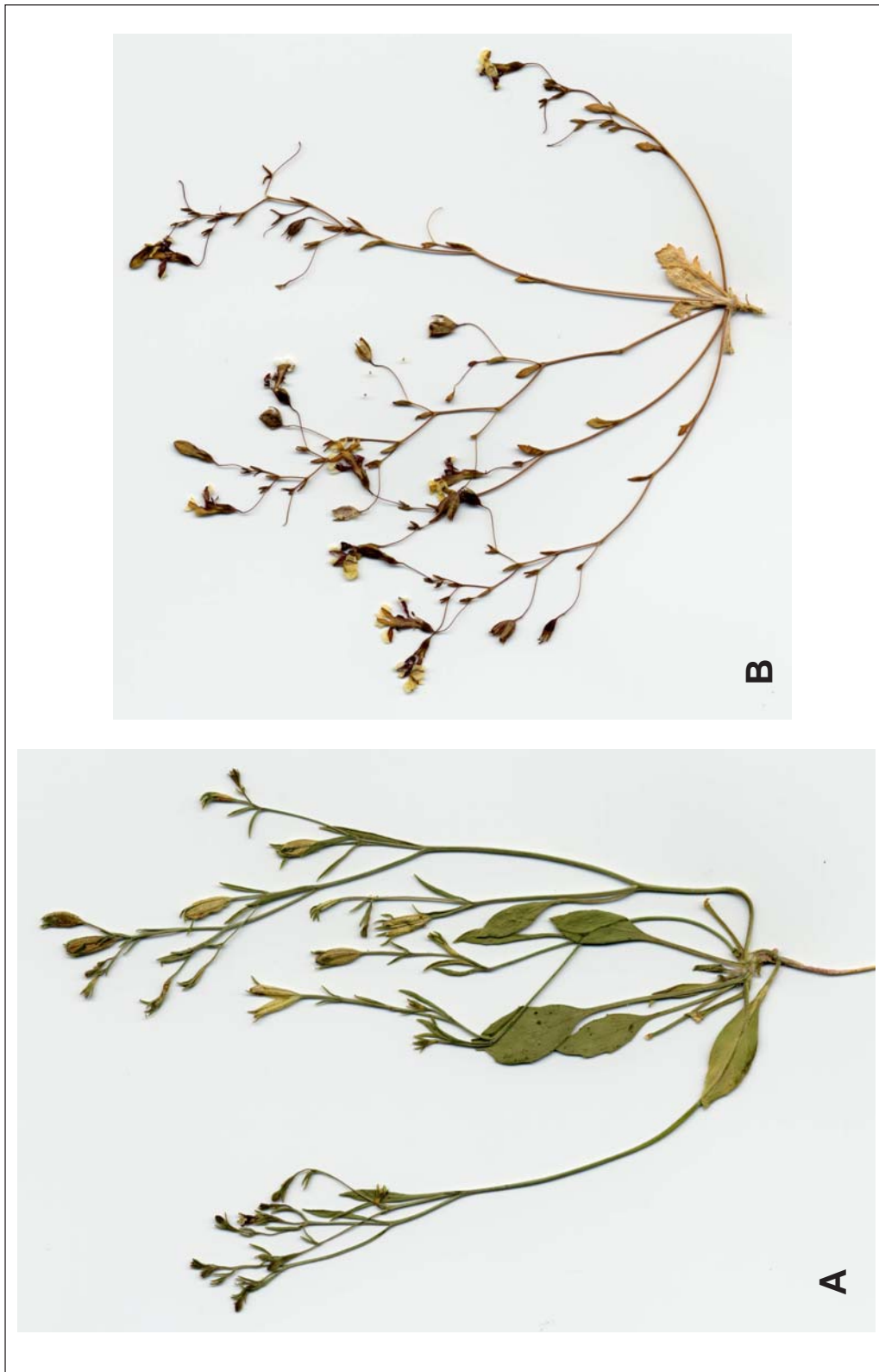
Figure 1. A – Specimen of Goodenia cylindrocarpa (D.E. Albrecht 6359, NT 90786). B – Specimen of G. halophila (D.E. Albrecht 7948, NT 94082).