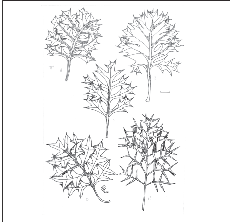
Figure 1. Leaf variations within Grevillea bipinnatifida . A - neotype, B-D - variations, E - subsp. pagna . Scale = 1 cm.