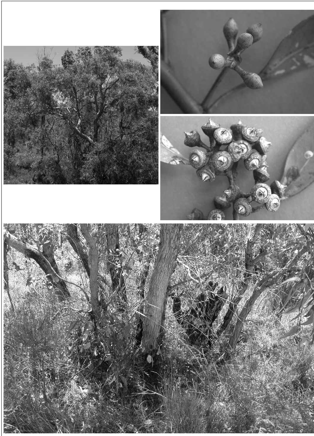
Figure 3. Eucalyptus relicta at the type location (Wardell-Johnson s.n.): (A) habit; (B) buds; (C) fruits; (D) trunks and bark of a resprouting individual.