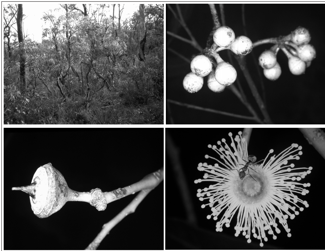
Figure 4. Eucalyptus lane-polei × relict – the only known clump. (A) habit; (B) buds; (C) flower; (D) fruit.

Flowering period. Probably January – February.