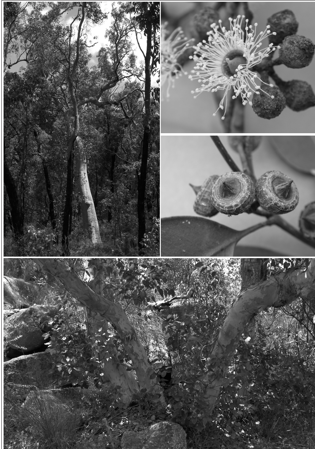
Figure 1. Eucalyptus virginea at the type location (Wardell-Johnson s.n.): (A) largest tree known, 22m tall and 87 cm d.b.h.; (B) buds and flower; (C) fruits; (D) trunks and bark of a resprouting individual in amongst granite boulders.