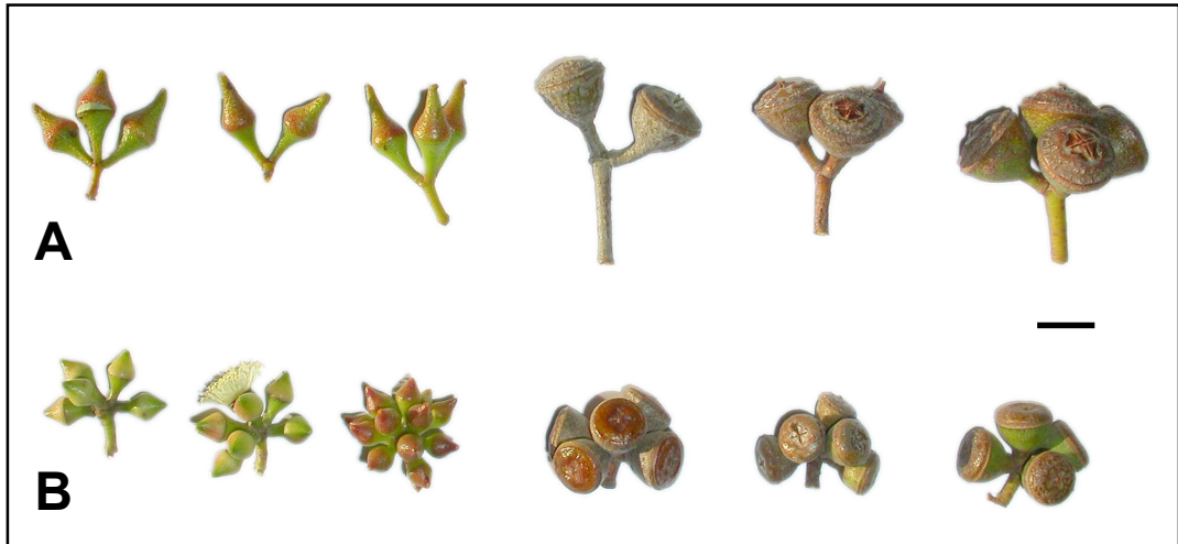
Figure 4. Mature flower buds and year old fruits. A – E. platydisca (top row; F1 of D. Nicolle 133, north side of Mount Norcott, north-east of Norseman, WA); B – E. diversifolia subsp. hesperia (bottom row; F1 of D. Nicolle 1811, east of Border Village, Great Australian Bight, SA). Scale bar = 10 mm.

narrower juvenile leaves, pointier opercula and a more consistently level fruit disc (none of which are as pronounced as in the new species) compared to typical E. diversifolia .