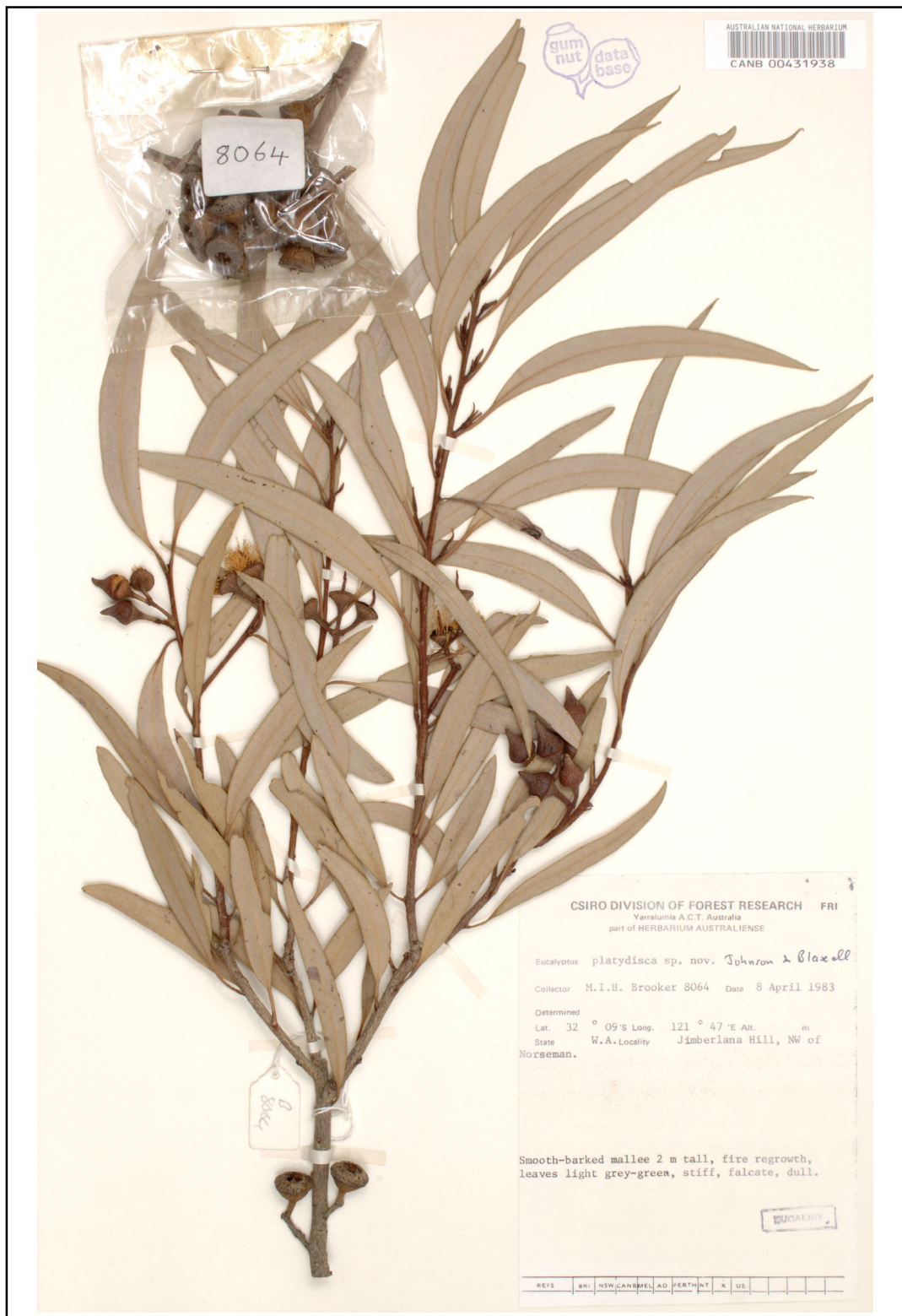
Figure 2. Holotype of Eucalyptus platydisca (M.I.H. Brooker 8064 – CANB 00431938).