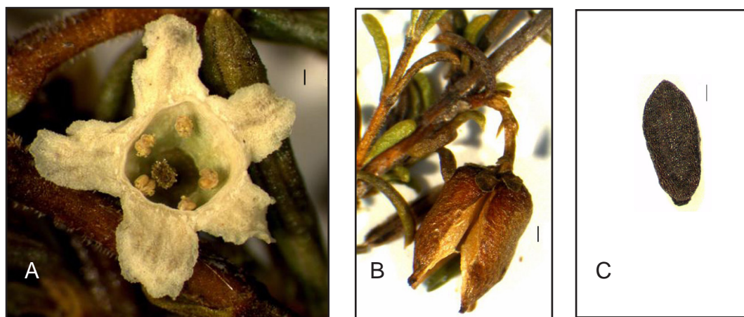
Figure 2. Logania sylvicola . A – male flower from above showing throat rim; B – dehiscent capsule; C – seed. Photographs by R.J. Cranfield from M. Hislop 3916 (A) and R. Davis 4687 (B & C). Scale bars = 1mm.