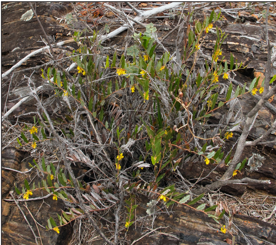
Figure 2. Labichea rossii growing out of cracks in massive ironstone on a small Banded Iron Formation ridge near Mount Holland. The dying back of some of the branches is probably due to the below average winter rainfall in 2010.

Conservation status. Labichea rossii was recently listed as Priority One under the Department of Environment and Conservation (DEC) Conservation Codes for the Western Australian Flora. It is only known from the type location where it is locally common. The population is estimated to comprise approximately 100 plants. Despite extensive fieldwork being undertaken in the area over a two week period, no further populations were located. The two closest outcrops of Banded Iron Formation occur on Mt Holland and North Ironcap. No Labichea was found on Mt Holland while Labichea stellata J.H.Ross was found in similar habitats on North Ironcap. Both of these outcrops are less than 5 km from the L. rossii site.