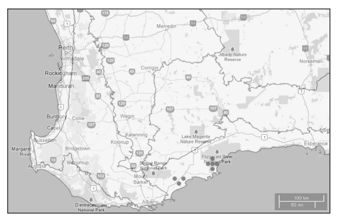
Figure 2. Distribution of Monotoca aristata ( \bullet ) in south–west Western Australia. Interim Biogeographic Regionalisation Version 6.1 (Department of the Environment, Heritage, Water and the Arts 2008) boundaries are indicated in grey.

Pollen . Albrecht et al. (2010) report that M. aristata pollen are pseudomonads of the unique 'Monotocatype' (Martin 1993), as in the rest of both Monotoca sens. strict. and Dielsiodoxa . Fossil pollen of this type has been recorded in early Pliocene assemblages from Lake Tay (as Gen. and sp. nov. B) by Bint (1981). Lake Tay is c. 200 km to the north-east of the Fitzgerald River and between the ranges of known populations of D. leucantha (E.Pritz.) Albr. and D. oligarrhenoides (F.Muell.) Albr.