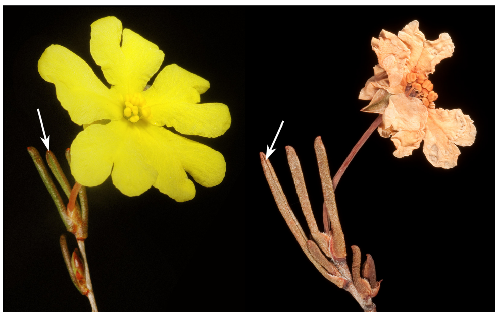
Figure 2. Hibbertia leptopus . Left – fresh flower (PERTH8339562); right – flowering shoot from dried specimen (PERTH6639429). Arrows highlight the grooved (folded) adaxial leaf surface.

Both species have (9–)11(–15) stamens around the three glabrous carpels, with usually three grouped (but free) stamens each alternating with two single stamens (i.e. a pattern of 3-1-3-1-3 stamens around the carpels), and short, almost globular anthers. They appear to be closely related.