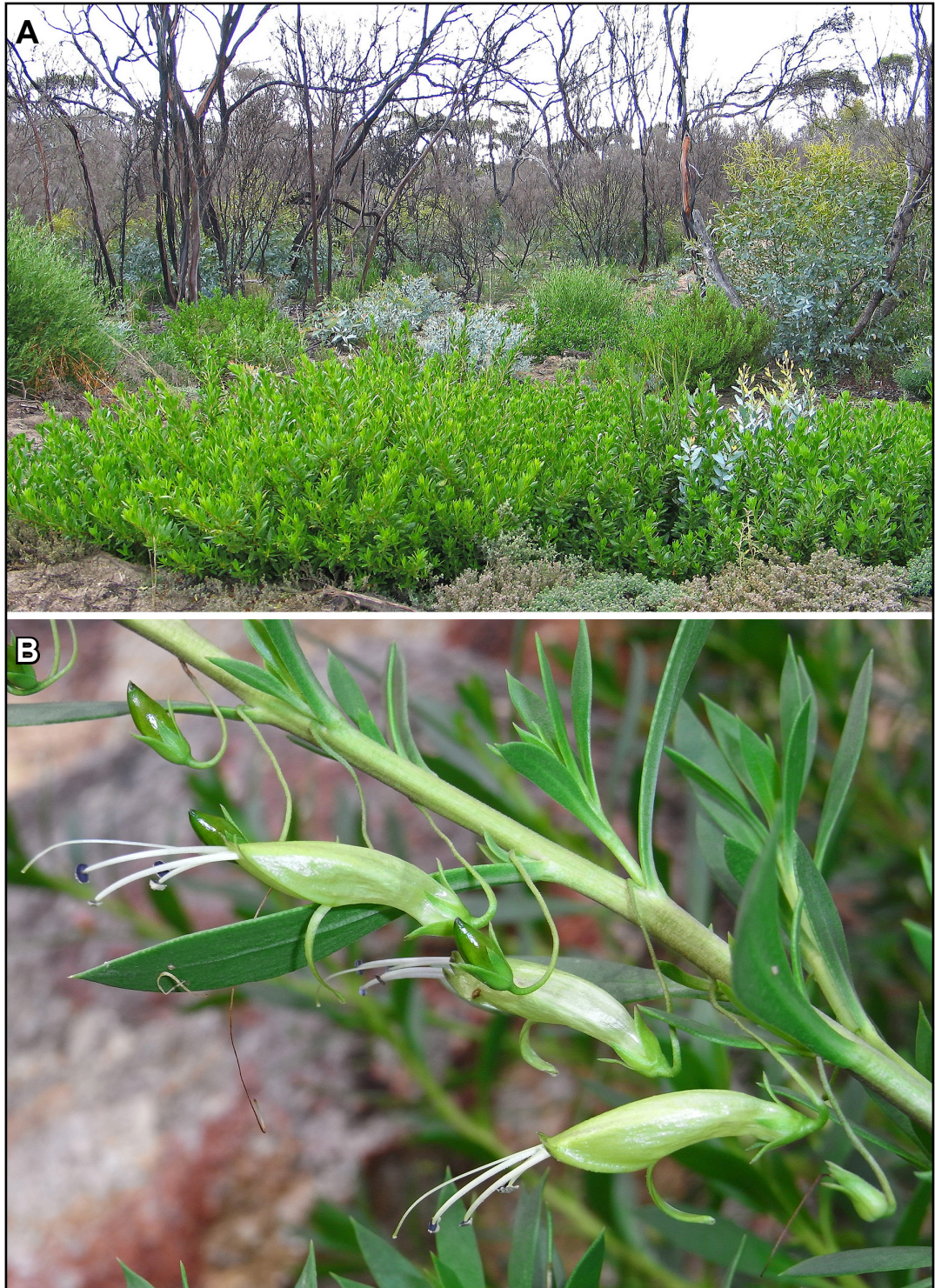
Figure 2. Eremophila calcicola . A – plants one year post-fire showing the bright green leaf colour and compact, low-growing habit of the species; B – flower showing the triangular, subequal sepals and zygomorphic, green, subglabrous corolla.