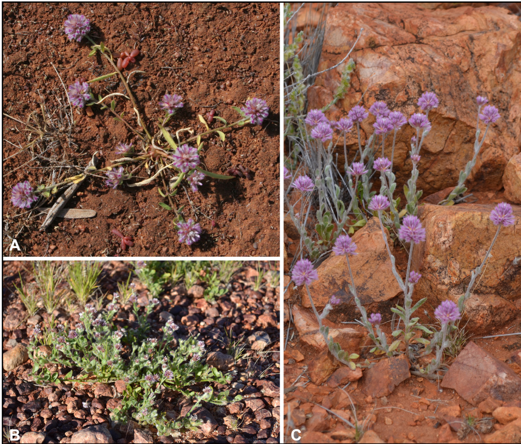
Figure 1. Comparative morphology of plants in situ , highlighting differences in habit and leaf form. A – Ptilotus actinocladus (G. Byrne 2759); B – P. pseudohelipteroides (T. Hammer & K. Thiele TH 91); C – P. helipteroides (R. Davis, T. Hammer & B. Anderson RD 12266).

Diagnostic features. Ptilotus actinocladus may be distinguished from all other members of the genus by the following combination of characters: a prostrate annual herb with glabrescent stems and leaves, glabrous and translucent bracts, pink flowers, tepals <10 mm long, 4 fertile stamens, 1 staminode 2.3–2.5 mm long, staminal cup appendages (pseudostaminodes) 0.5–0.6 mm long, an excentric style placed on the ovary summit, and an apically hairy ovary.