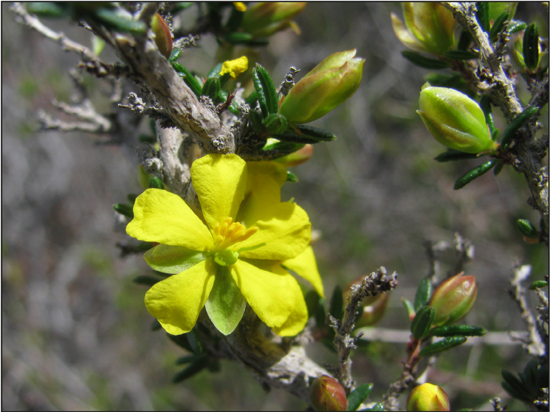
Figure 1. Flowering branch of Hibbertia tuberculata . ( W. Thompson & J. Allen 950).

Phenology. The known collections were flowering in September and October.