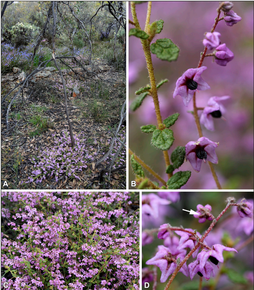
Figure 2. Thomasia julietiae . A – habitat and habit; B – small, elliptic leaves and monochasium of mauvish pink flowers with dark reddish purple ribs; C – plant in situ highlighting the horticultural potential of this floriferous species; D – narrow epicalyx bracts at the base of the flowers (white arrow) and small scale-like stellate hairs on the peduncle and pedicels.

Affinities. Thomasia julietiae is morphologically most similar to T. microphylla Paust and T. sp. Green Hill (S. Paust 1322), species that also have narrowly triangular to narrowly ovate anthers and a 3-locular ovary. Other species from the T. stelligera species group, namely T. stelligera , T. pygmaea (Turcz.) Benth. and T. gardneri Paust, have oblong to ovate anthers and four or five locules per ovary. Thomasia julietiae can be distinguished from T. microphylla and T. sp. Green Hill by its generally longer peduncles (11–41 mm long vs 5–30 mm) and smaller calyx (3.7–5 mm long vs 5.5–9 mm). It also has rough (rather than smooth) leaves as a result of the veins being slightly sunken.