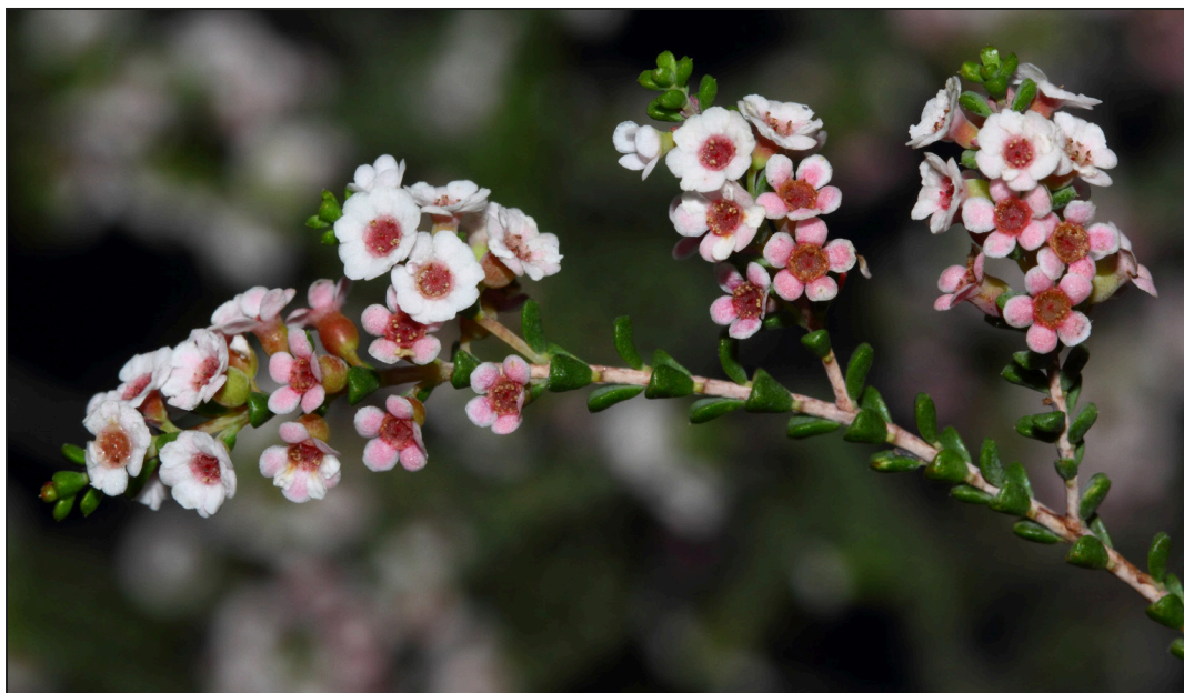
Figure 2. Thryptomene planiflora in flower and fruit. from J.A. Wege & K.A. Shepherd JAW 2037 .

Affinities. Thryptomene planiflora can be distinguished from other members of sect. Thryptocalpe as indicated in the key below.