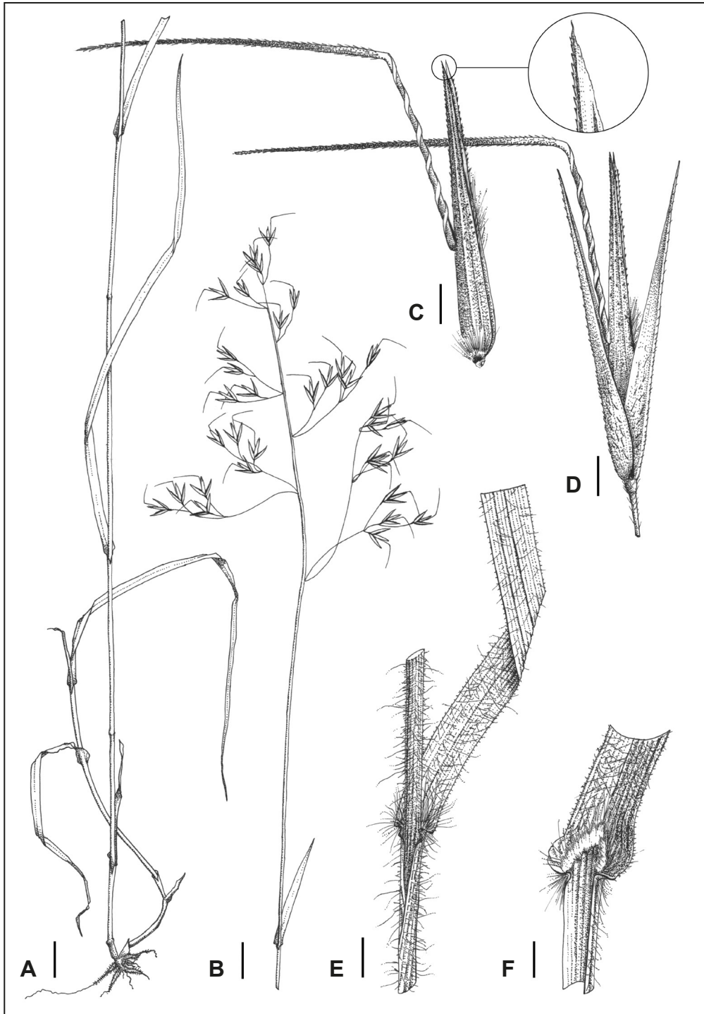
Figure 2. Deyeuxia abscondita . A – habit, showing culm and leaves; B – panicle and upper part of culm; C – floret, showing protruding plumose tuft of hairs from rachilla extension and enlargement of a lateral lobe apex (inset); D – spikelet; E – section of culm, leaf sheath and both leaf lamina surfaces, showing indumentum; F – ligule and base of leaf lamina. Scale bars = 10 mm (A, B); 1 mm (C, D); 3 mm (E); 2 mm (F). Drawn by Cielito Marbus from F. Mueller s.n. (PERTH ex MEL 2127721A).